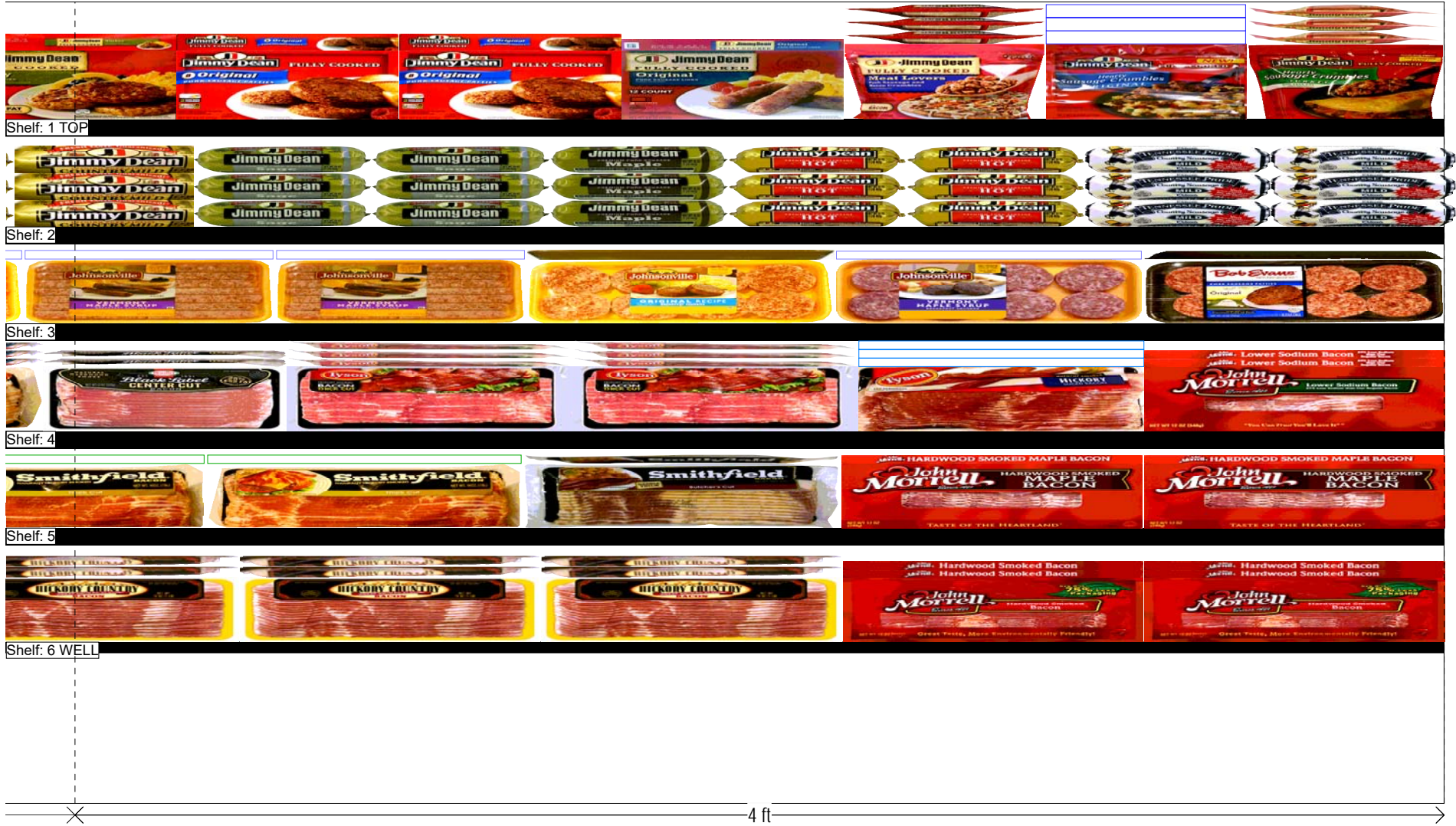
Shelf: 1 TOP

HQ DeCA PLANOGRAM - CHILL MEAT 48 FT FOR CLASS 2 STORES - MW MARKETING AREA