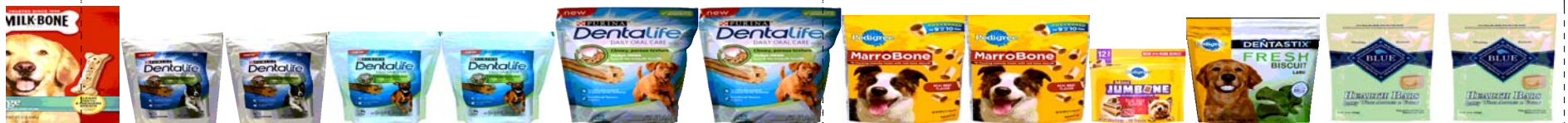
Shelf: 6 BASE