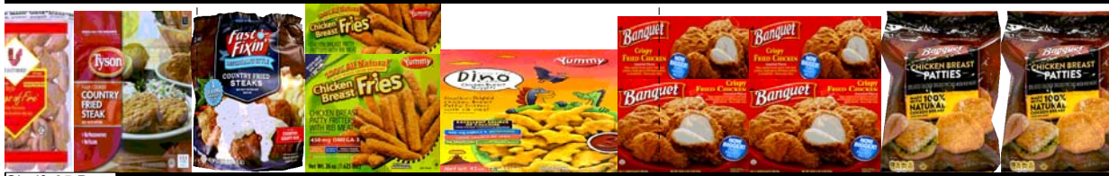
Shelf: 05 Base