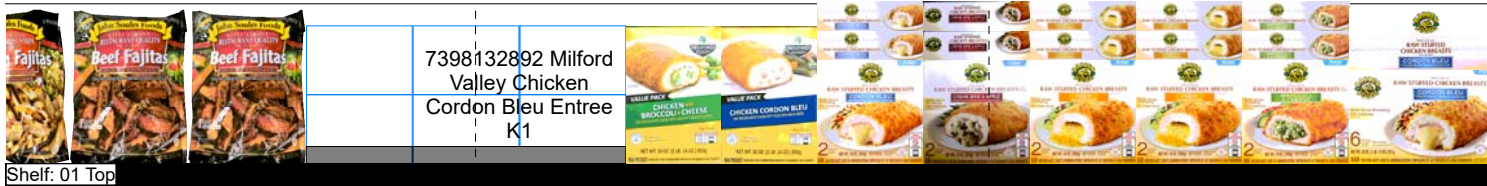
Shelf: 01 Top

7398132892 Milford Valley Chicken Cordon Bleu Entree K1