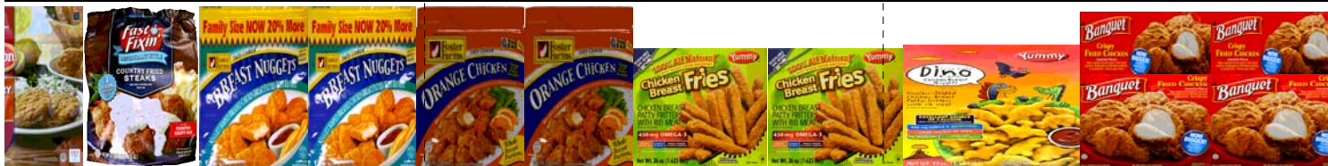
Shelf: 05 Base